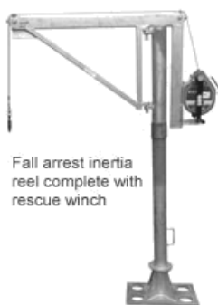
Fall arrest inertia reel complete with rescue winch